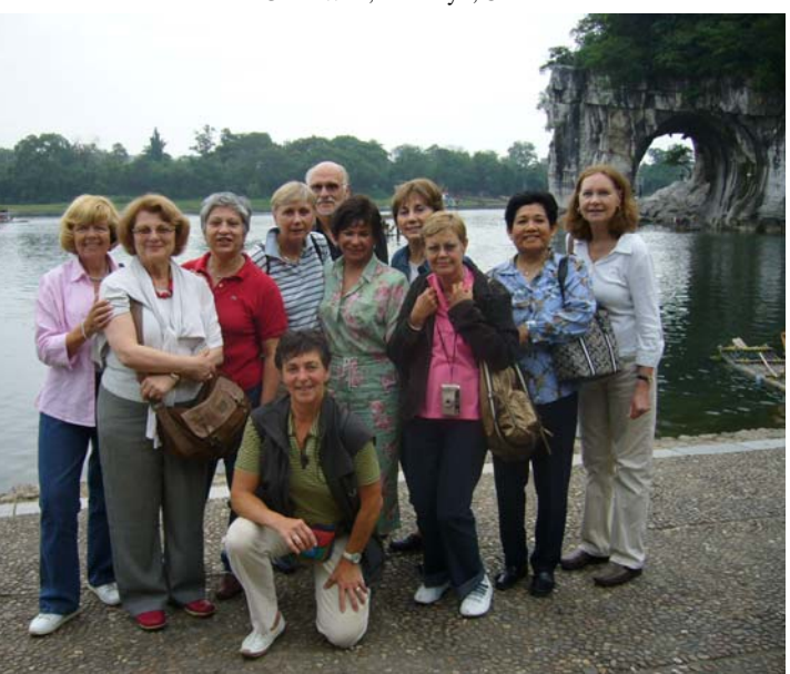
In Guilin - Elephant Trunk Hill