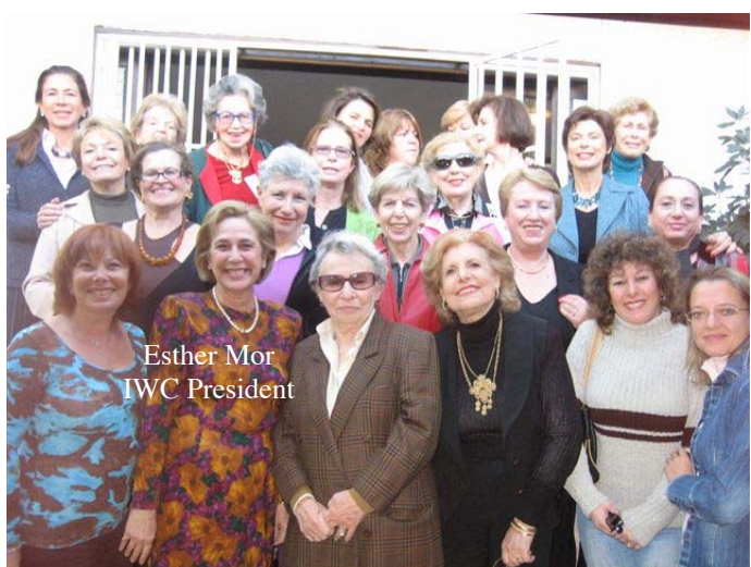
IWC-Israel, Board & Club Members

The IWC-ISRAEL was founded in 1969 by a number of local ladies together with some ambassadors' wives who were stationed in Israel at that time.