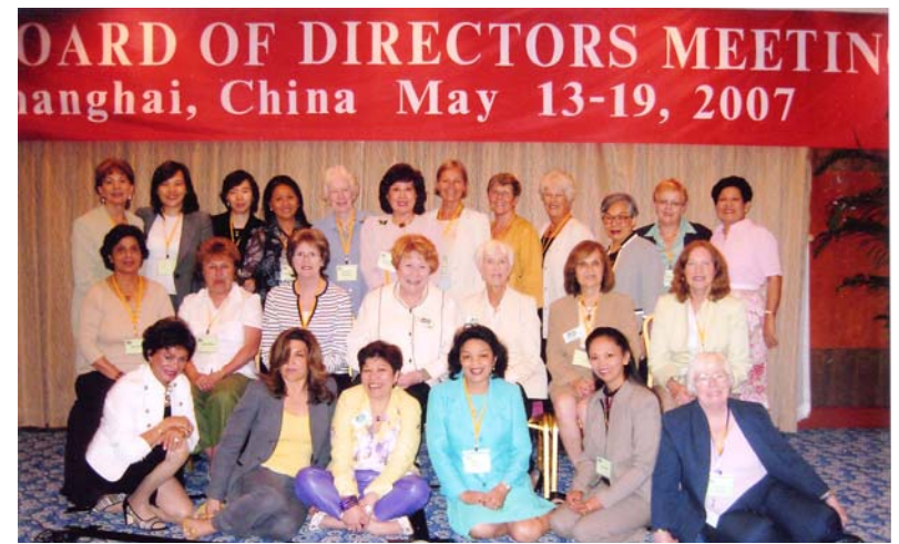
WCI Board of Directors

WCI wishes to thank Welcome Club International, Shanghai for their incredible hospitality while hosting our 2007 Annual Board of Directors meeting. We were greeted, feted, fed, and thoroughly spoiled during our stay in this fascinating city. We saw how pearls were extracted from the oyster, watched silk being spun from cocoons, visited museums, cruised on the river, and shopped - and shopped - and shopped. However we also worked as hard as we played, and the following are highlights from our Board meetings: