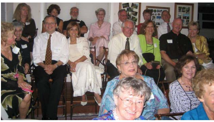
WTC Members enjoying a Movie at a Member's Home Theater