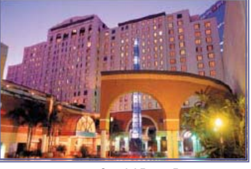
Special Room Rates For WCI Conference:

Final Conference Packages, including detailed Schedule of Events, Conference Costs and Registration Forms, will be sent to all clubs in November, 2007. Registration fees are due by February 10, 2008 and final payment of Conference Package is due by April 15, 2008. All registration fees and conference costs can be paid by credit card. All information and instructions will be detailed in the Conference Package emailed to each club in November, 2007.